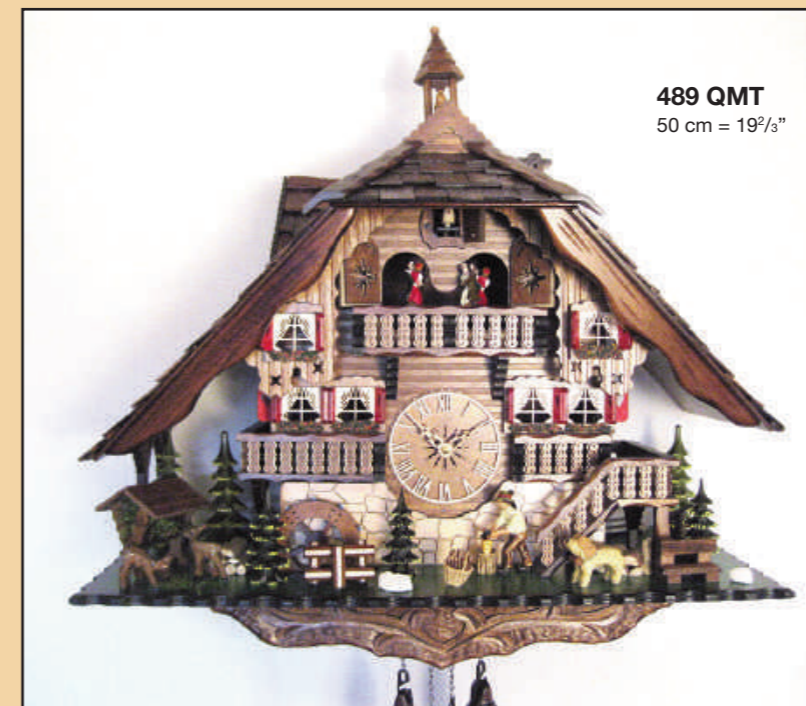
489 QMT 50 cm = 19 2/3"