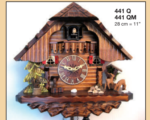
441 Q 441 QM 28 cm = 11"