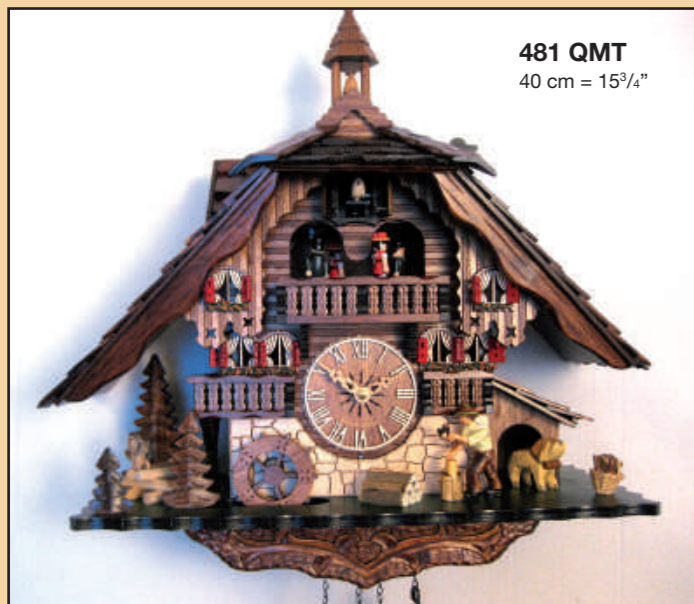
481 QMT 40 cm = 15 3/4"