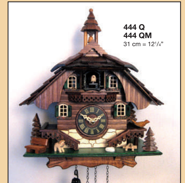
444 Q 444 QM 31 cm = 12 1/4"