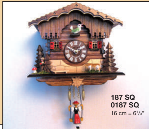
187 SQ 0187 SQ 16 cm = 6 1/8"