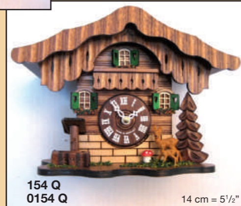
154 Q 0154 Q 14 cm = 5 1/2"