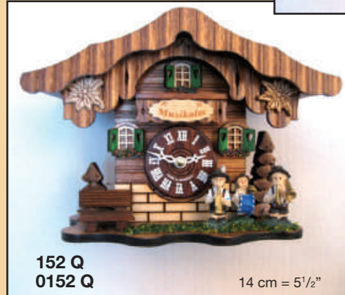
152 Q 0152 Q 14 cm = 5 1/2"