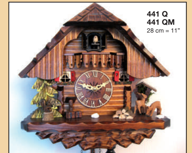
441 Q 441 QM 28 cm = 11"