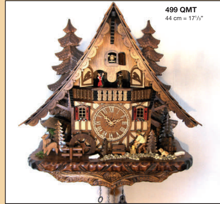
499 QMT 44 cm = 17 1/3"