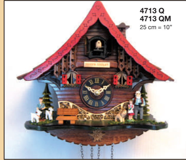
4713 Q 4713 QM 25 cm = 10"