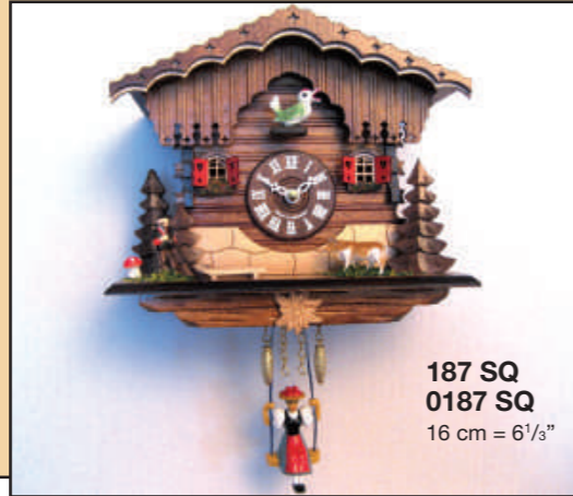
187 SQ 0187 SQ 16 cm = 6 1/3"