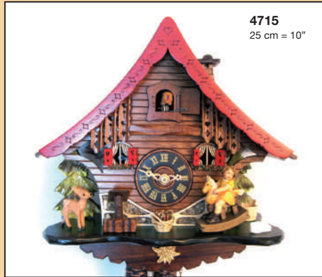
4715 25 cm = 10"