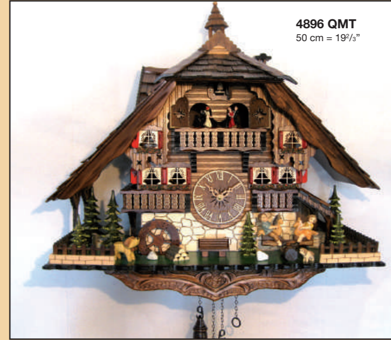
4896 QMT 50 cm = 19 2/3"