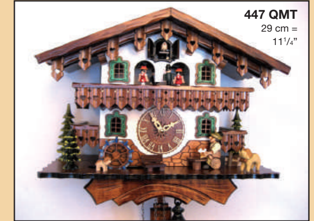
447 QMT 29 cm = 11 1/4"