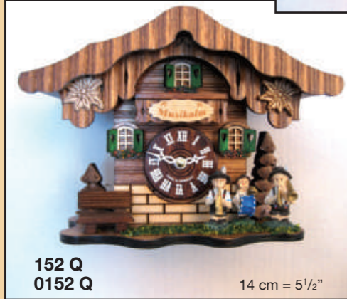
152 Q 0152 Q 14 cm = 5 1/2"