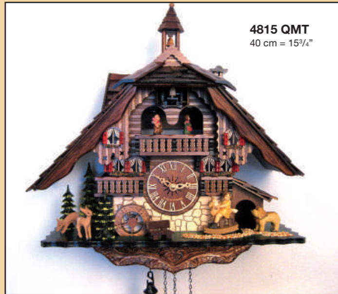
4815 QMT 40 cm = 15 3/4"