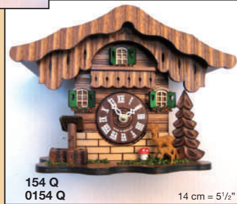
154 Q 0154 Q 14 cm = 5 1/2"