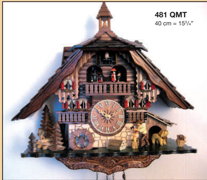
481 QMT 40 cm = 15 3/4"