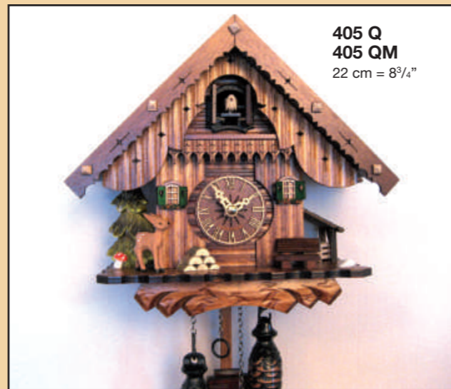
405 Q 405 QM 22 cm = 8 3/4"