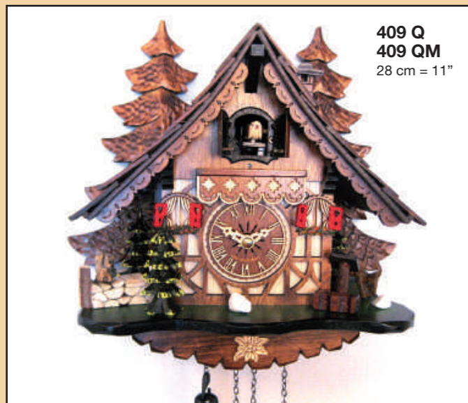
409 Q 409 QM 28 cm = 11"

transparent box for all quartz and mechanical models 522 – 522/16, 417 and 415 (item no. + »KV«, for example. 522 Q KV)