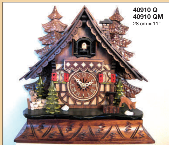
40910 Q 40910 QM 28 cm = 11"