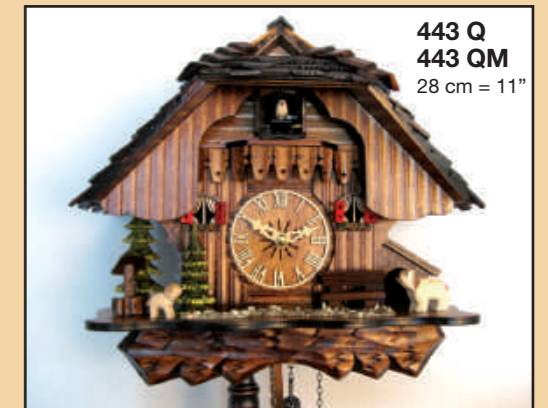
443 Q 443 QM 28 cm = 11"