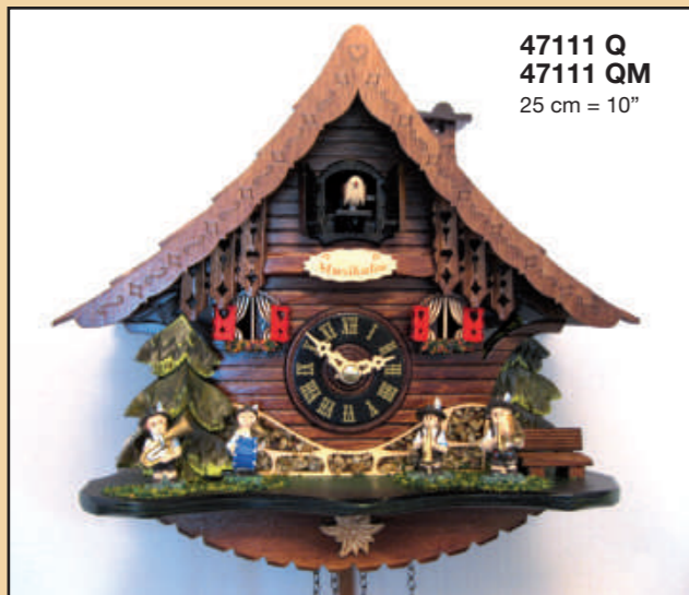
47111 Q 47111 QM 25 cm = 10"