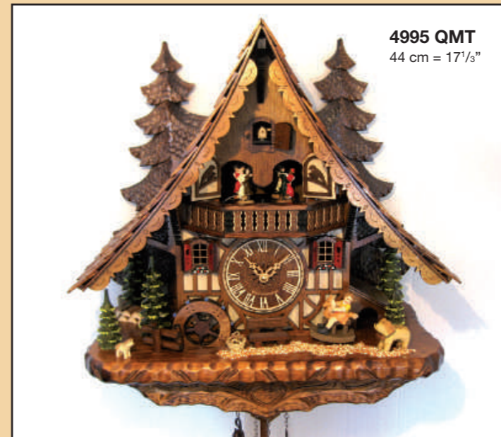
4995 QMT 44 cm = 17 1/3"