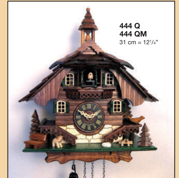
444 Q 444 QM 31 cm = 12 1/4"